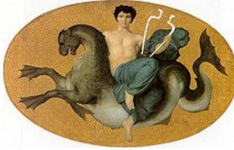
Arion on a sea horse, by William-Adolphe Bouguereau (1855)

According to a digression in Herodotus' account of the Lydian empire under the Mermnads occasioned simply by the appearance of the name of Periander, Arion attended a musical competition in Sicily, which he won. On his return trip from Tarentum, avaricious sailors plotted to kill Arion and steal the rich prizes he carried home. Arion was given the choice of suicide with a proper burial on land, or being thrown in the sea to perish. Neither prospect appealed to Arion, and he asked for permission to sing a last song to win time. Playing his kithara, Arion sang a praise to Apollo , the god of poetry, and his song attracted a number of dolphins around the ship. At the end of the song, Arion threw himself into the sea rather than be killed, but one of the dolphins saved his life and carried him to safety at the sanctuary of Poseidon at Cape Tainaron. This dolphin was catasterised as the constellation Delphinus, by the blessings of Apollo. Arion, according to Herodotus' brief excursus, then continued to Corinth by other means and arrived before the sailors that tried to kill him. On his return to Corinth, the king didn't quite believe Arion's fantastic story. The sailors believed Arion was dead in the sea, and on arrival in Corinth they told the king that Arion had decided to remain in Italy. After, Arion presented himself and they could no longer deny the truth